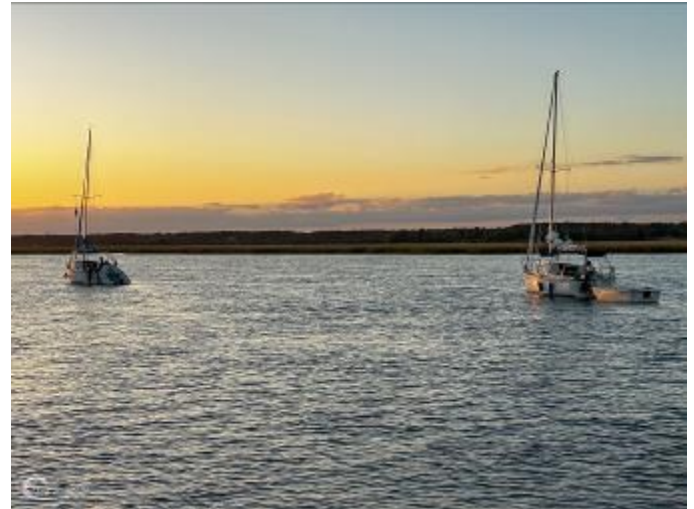
Headed for McClellanville

We were underway around 0800 Thursday morning, October 26th, headed for our destination of McClellanville. We followed the Intracoastal Waterway pretty much without incident all day. It wasn't until after lunch we came across the American Eagle, a 100-passenger cruise ship headed south to Charleston. The Intracoastal Waterway was narrow with a fair amount of shoaling on each side. The ship was making slow progress. We could see she was churning up a lot of silt and mud behind her and we would have to pass with caution. We slowly picked our way along her port side, safely passing through the silt and continued along our way.