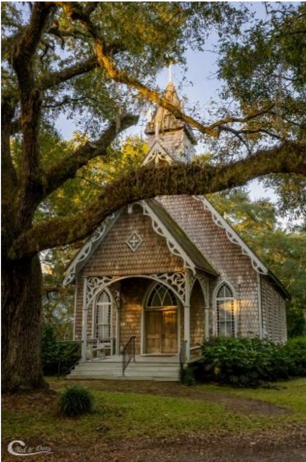
St. James-Santee Parish Episcopal Church