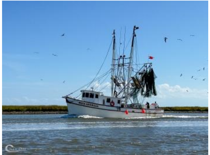
Shrimp Boat Returning from the Atlantic Ocean to McClellanville