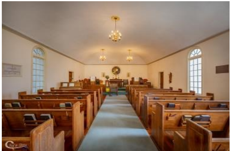
McClellanville United Methodist Church