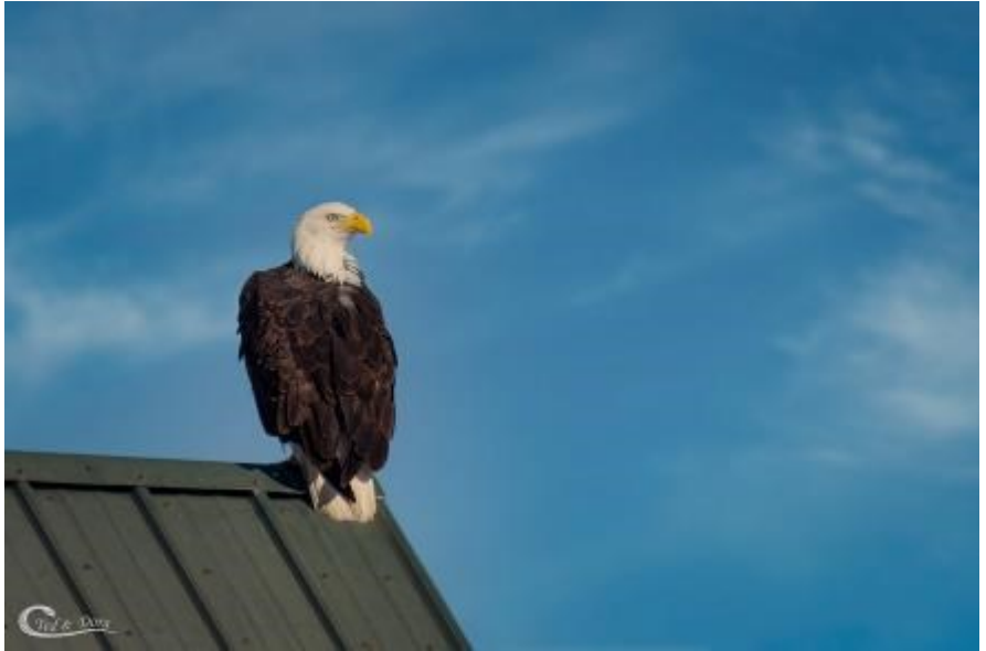
Bald Eagle Sighting

We were up at first light, Sunday October 29. We had to make up the two hours we lost Saturday if we were going to make it back to Cooper River Marina at a reasonable hour. We followed the Intracoastal Waterway south, retracing our route back to Charleston. Not far from Capers Island we spotted a bald eagle on the rooftop of an old house. We cleared Sawyer Bridge around 1400 and turned east. We were able to set sail in Charleston harbor for a while, but a dying breeze and the weekend boat traffic made it hard to sail. Eventually we took the sails in and motored the rest of way, passing Castle Pinckney, the Charleston Battery, Patriots Point, and the Yorktown. We pulled into Cooper River Marina around 1630.