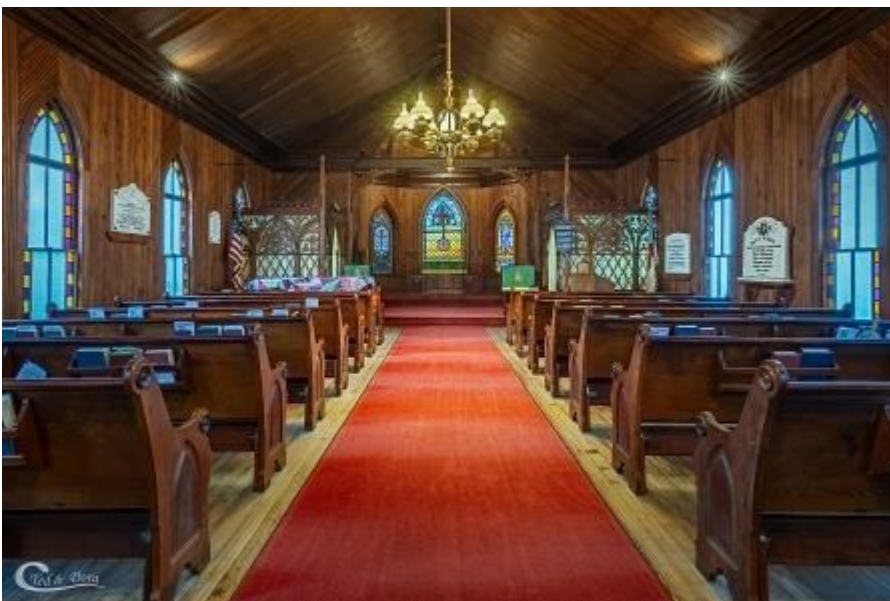
St. James-Santee Parish Episcopal Church