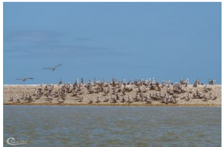
Birds Gathered Together Near Capers Island